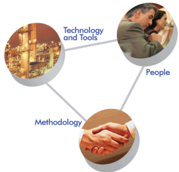
Meeting Client Needs

KBC offers a comprehensive range of consulting, implementation, and training solutions to provide sustainable competitive advantage to our process industry clients worldwide.